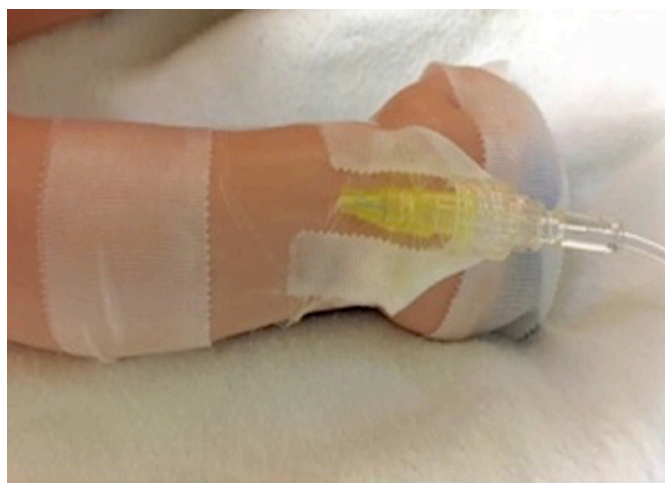
Figure 1 Sangam's intravenous securing method: Peripheral intravenous site secured with transparent tegaderm over the catheter and no opaque tape applied along its entire intraluminal portion.

One of the main factors that cause severe infiltration is failure to recognise them in the initial stages. We have identified that less occlusive dressing on the catheter can provide better visualisation of the intravenous site. We developed a unique intravenous securing method, Sangam's method. Intravenous catheter from the site of insertion into the lumen of a vein to its entire length above the site of insertion is covered only with a transparent