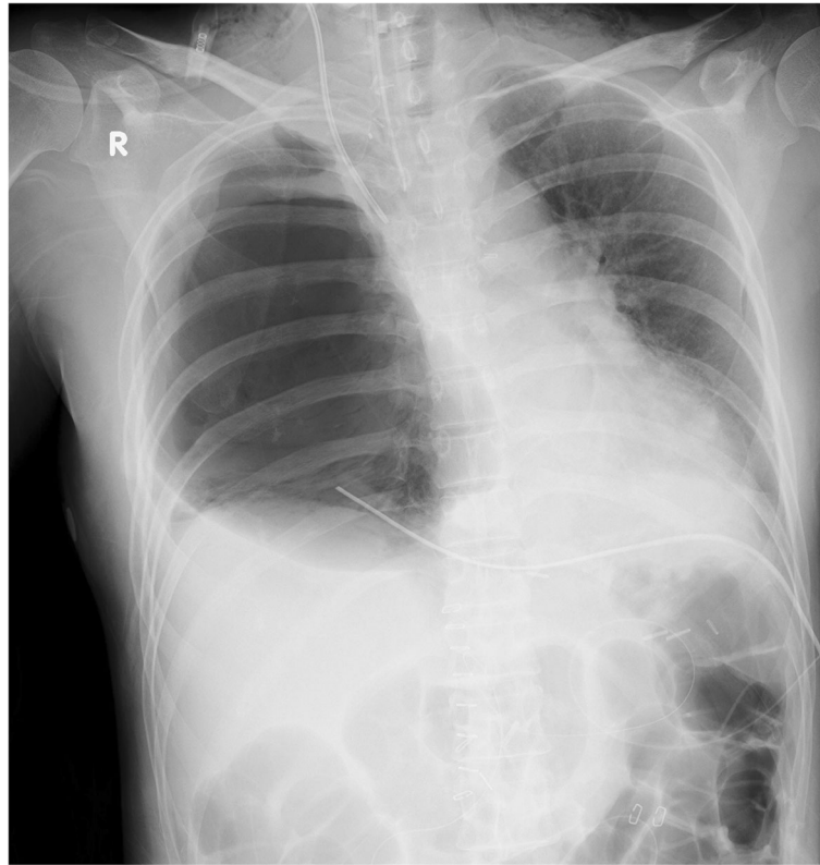
Fig. 1 Chest radiograph obtained upon rapid development of tachypnea