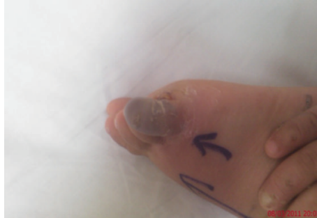
FIGURE 1: Photograph of the right foot showing necrosed right little toe resulting from severe infection before amputation at age of 2.8 years.