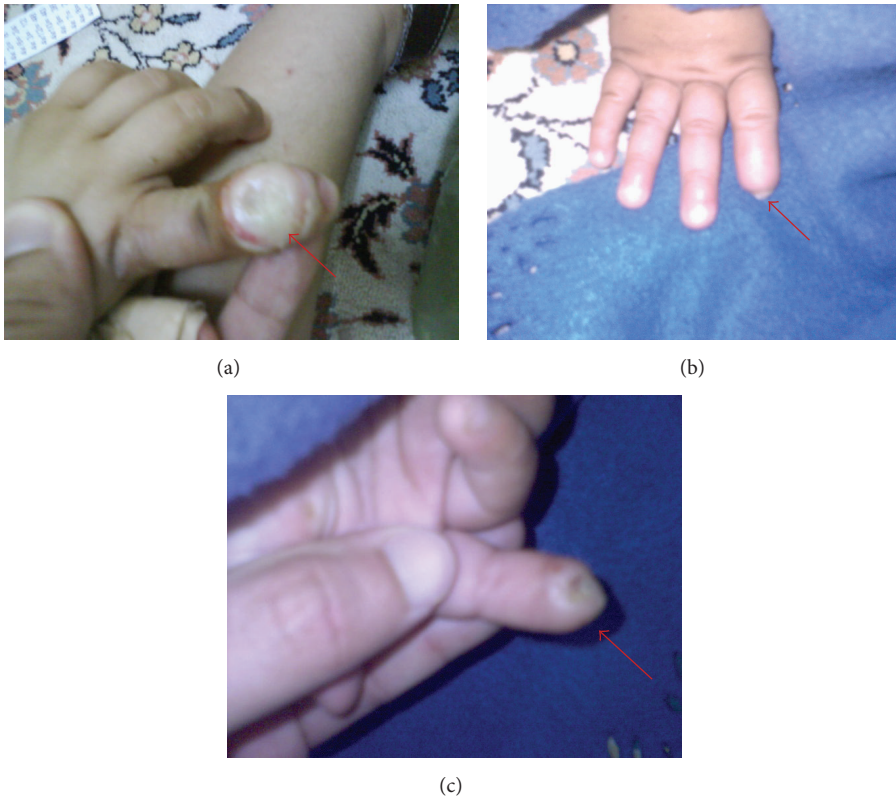
FIGURE 2: (a) Photograph at age two, showing self-inflicted traumatic ulcer due to biting. (b) Photograph at age four, showing self-amputation of the terminal phalanges of the right index finger from dorsal aspect. (c) Photograph at age four, showing self-amputation of the terminal phalanges of the right index finger from ventral aspect.

that had brought them to seek dental treatment. General examination showed a fully alert patient with hyperactive behavior and short attention span. The patient's height and weight was appropriate for his age with normal gait and posture. There was an extensive damage to index finger of the right hand due to biting and chewing (Figures 2(a), 2(b), and 2(c)).