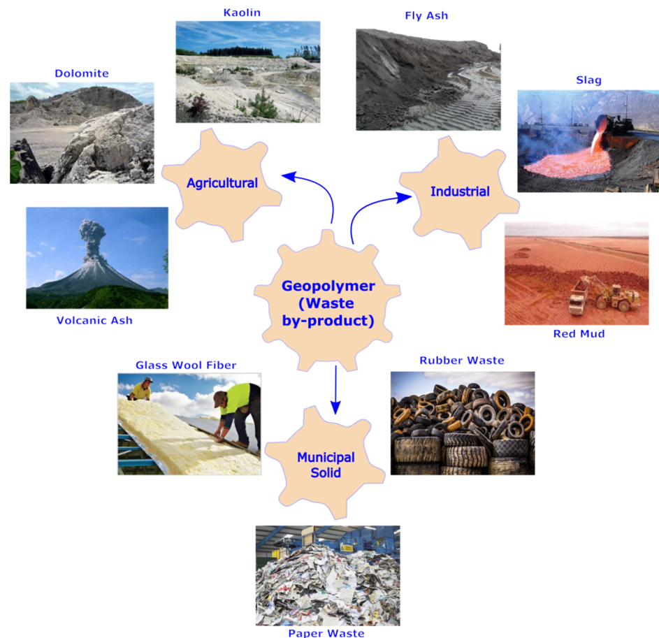
Figure 1. Common type of precursor materials used in geopolymer material.

Geopolymer precursor material must be alumina (Al 2 O 3 ) and silica (SiO 2 ) component, preferably in reactive amorphous form, in both natural and by-product forms. For the geopolymerization of these aluminosilicate precursors, alkaline activating solutions such as potassium or sodium hydroxide (KOH, NaOH), and potassium or sodium silicate (K 2 SiO 3 , Na 2 SiO 3 ) are required. The primary phase begins with the dissolution. In an alkaline media, the species interact ionically, followed by the breakage of the covalent bond between