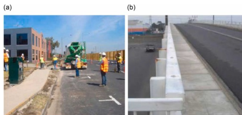
Figure 5. (a) Westgate Freeway paving in Port Melbourne and (b) E-Crete Precast Panels. Reprinted/adapted with permission from [122]. 2012. Van Deventer.

Figure 5a depicts a section of the Westgate Freeway in Port Melbourne's highway pavement. Since it was a different material, the project had to comply to numerous needs of the local road authority as well as more specialized technical standards in order to gain government clearance. The highway's construction and use were agreed on by a group of multinational construction corporations. Meanwhile, Figure 5b illustrates VicRoad's installation of 55 MPa E-Crete prefabricated panels. Due to the strict inspection in regard to structural concrete, this strength was required [122].