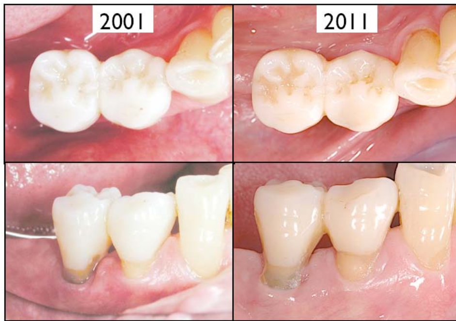
Fig. (3). Clinical situation after restoration (year 2001, left) and after 10 years (right). Some generalized recession had developed. Some plaque is visible. Otherwise the situation is stable. No probing pocket depths > 4 mm were recorded.

brushes, for the first 3 months. The patient was recalled at 3 and 6 months. At the six-month re-evaluation, no pockets \geq 3 mm and no bleeding on probing were detected. Treatment was completed with the adhesive placement of an indirect fiber-reinforced endocrown without post but a central retention cavity inside the pulp chamber (Targis-Vectris, Ivoclar Vivadent, Schaan, Liechtenstein). One year after surgery and 6 months after restorative treatment, there were still no clinical signs of inflammation or pocket formation. The radiograph showed evidence of good endodontic and periodontal healing with signs of the formation of a periodontal ligament (Fig. 1D, E). The patient then left our clinic and was referred back to a private dentist. Ten years after surgery, we were able to contact the patient and re-examine the situation.