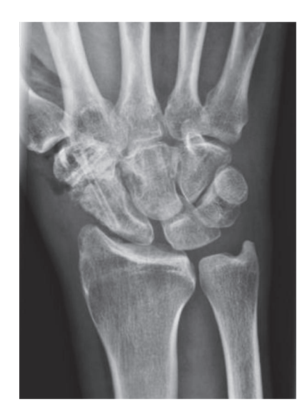
FIGURE 3: X-ray right wrist a.p. following STT-fusion with magnesium-based screws.