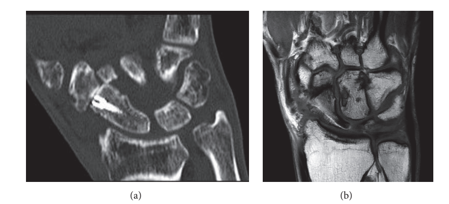
FIGURE 2: (a) CT-scan showing consolidated fracture of the scaphoid and progression of osteoarthritis in STT-joint. (b) MRI-scan showing healed fracture of the scaphoid with regular perfusion.

FIGURE 1: (a) X-ray of right wrist showing fracture of the scaphoid and preexistent osteoarthritis of the STT-joint. (b, c) Preoperative CT-scan demonstrating fracture of scaphoid classified as Herbert B2 but also clearly demonstrating degenerative changes of the carpal bones.