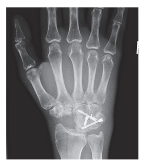
FIGURE 6: X-ray right wrist a.p. showing consolidated 4-corner fusion.

implants occurred in the present case. In a clinical application study good results were reported using magnesium-based headless bone screws for Chevron osteotomy [5]. However