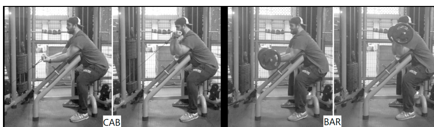
Figure 1. Examples of how cable (CAB) and barbell (BAR) preacher curls were performed.

It remains unclear whether strength and hypertrophy changes occur in dynamic exercises when the highest torque application is during different positions of the range of motion. That is to say, will larger strength and hypertrophy gains occur when the highest torque is produced in a specific range of motion? Therefore, this study was designed to compare the responses to two preacher curl exercises, in which maximal force was applied in a shortened or an elongated position following 10 weeks of progressive resistance training in young adults. In order to investigate these points, participants were invited to perform the exercises on a cable-pulley system (CAB), in which a greater torque was applied during the exercise when elbows were flexed and biceps shortened, or with a barbell (BAR), in which greater torque was applied when the elbows were extended and biceps elongated (Figure 1). It was hypothesized that the increase in muscular strength would be angle-specific [13,15], and greater hypertrophy would be observed for the BAR group [13].