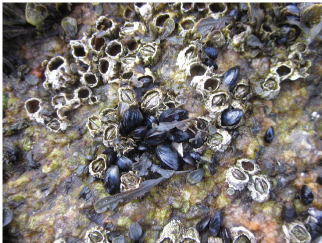
Figure 5. Whitehead at the time of arrival of the drift ice. Picture taken at low tide on 3 April 2014 at the wave-exposed site from Whitehead shown in Figure 2. This picture shows the mussels and barnacles that were abundant in understory habitats below the Fucus canopy, which was removed to take the picture.

conspicuous canopy that covered smaller algae, such as C. crispus and coralline algae, and a diversity of small invertebrates (Figure 6).