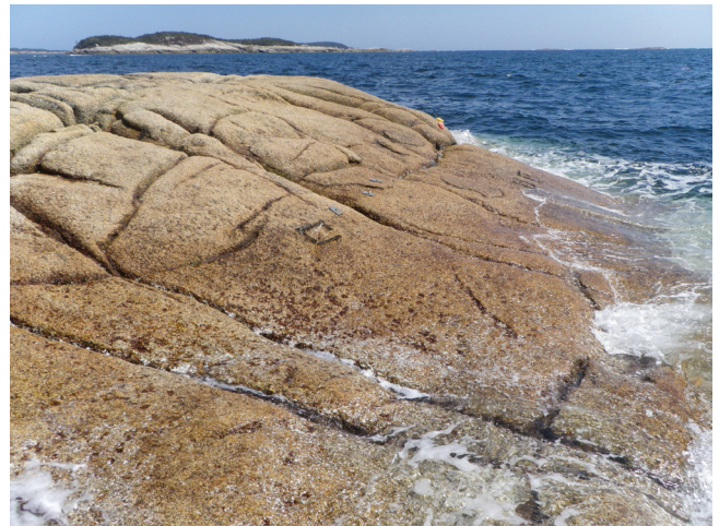
Figure 7. Whitehead after ice scour. Picture taken at low tide on 30 April 2014 at the wave-exposed site from Whitehead shown in Figure 4, showing the extreme removal of algae and invertebrates by the sea ice, which stayed for 9 days on the shore. The little barnacle recruitment plates visible in this picture were drilled to the rocky substrate at an elevation of approximately 2/3 of the full intertidal range (between chart datum, or 0 m in elevation, and the elevation where the barnacles located highest on the shore occurred before the ice scour).

but some organisms were able to survive in some protected areas (Figure 9). The magnitude of ice scour in mainland Nova Scotia in 2014 was such that ice effects were even observed in wave-sheltered habitats. In such habitats, which are normally dominated by the perennial brown seaweed Ascophyllum nodosum 9 , the movement of ice fragments is relatively limited 8 . However, in 2014, biomass losses