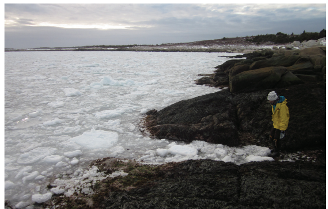
Figure 3. Whitehead at the time of arrival of the drift ice. Picture taken at low tide in the late afternoon of 3 April 2014 from the wave-exposed site in Whitehead shown in Figure 2. This picture shows the variable size of the ice fragments at the time of their first contact with the shore.