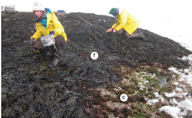
Figure 4. Whitehead at the time of arrival of the drift ice. Picture taken at low tide on 3 April 2014 at the wave-exposed site from Whitehead shown in Figure 2. This picture shows the intertidal zone covered by a Fucus canopy at high and middle elevations (f) and by Chondrus crispus and coralline algae at low elevations (c), which also exhibit the first ice fragments that contacted the shore on that day.