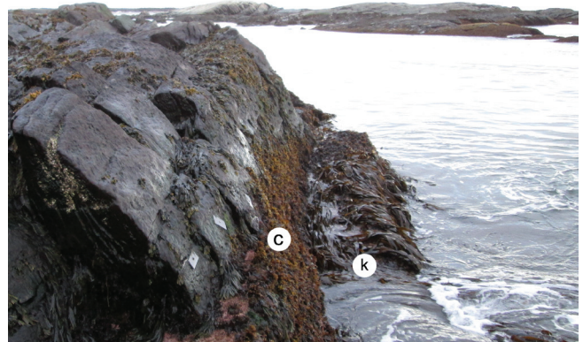
Figure 6. Tor Bay Provincial Park shortly before the arrival of the drift ice. Picture taken at low tide on 4 April 2014 at a wave-exposed site in Tor Bay Provincial Park, showing a well developed canopy of Chondrus crispus at middle-to-low elevations (c) and a kelp canopy at the lowest elevations (k). The little plates that are visible above the C. crispus zone were drilled into the rocky substrate to study barnacle recruitment. The sea surface was calm on that day, and sea ice was visible towards the horizon.

The ice scour that occurred on those shores for days until the ice melted removed a large amount of algae and invertebrates. The duration of the presence of sea ice on the shore was related to the intensity of biological damage. For instance, in Whitehead, which sustained 9 full days (between 4–12 April) of ice coverage (Canadian Ice Service), the intertidal zone underwent an almost total loss of organisms (Figure 7). At Tor Bay Provincial Park, which sustained 4 days (between 6–9 April) of ice coverage (likely because it is farther away from the ice source), biomass losses were also high (Figure 8),