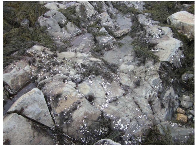
Figure 10. Tor Bay Provincial Park after ice scour. Picture taken at low tide on 27 April 2014 at a wave-sheltered site in Tor Bay Provincial Park, showing the loss of the Ascophyllum nodosum canopy that had previously covered these habitats for an undetermined number of years (at least 10, based on observations by R.A.S.). Remains of A. nodosum canopies are seen in the upper-left corner and upper-right corner of this picture.

As the duration of the ice presence on the open Atlantic coast of Nova Scotia generally decreases from the Cabot Strait southwards, albeit not linearly (Canadian Ice Service), the observations herein described suggest that intertidal community structure may be influenced by latitude mediated by ice scour effects. We predict that communities from northern locations in this coastal range would remain in early successional stages, as such places receive drift ice