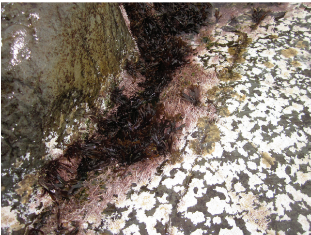
Figure 9. Tor Bay Provincial Park after ice scour. Picture taken at low tide on 27 April 2014 at the wave-exposed site from Tor Bay Provincial Park shown in Figure 6. This picture shows the post-ice survival of some algae in protected sites.

were still high in some wave-sheltered habitats, leaving extensive areas without any significant macroalgal coverage (Figure 10).