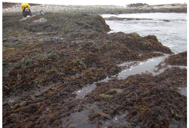
Figure 11. Sober Island after the ice season. Picture taken at low tide on 1 May 2014 at a wave-exposed site in Sober Island, showing a full coverage of seaweed canopies, as the sea ice had not reached this shore during the previous 7 years.

from the Gulf of St. Lawrence mostly every year. Conversely, communities from southern locations in this coastal range might reach more mature stages because of sea ice failing to reach those places for a number of years. This notion is supported by the fact that, on Sober Island (44° 49' 20.3" N, 62° 27' 26.5" W), which is located south of the southernmost reach of the sea ice in 2014 (Figure 1) and has not been exposed to ice floes since 2007 (Canadian Ice Service), intertidal communities were well developed and seaweeds extensively covered the rocky surface shortly after the 2014 ice season (Figure 11). We suggest that a multiannual survey of ice conditions