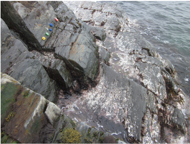
Figure 8. Tor Bay Provincial Park after ice scour. Picture taken at low tide on 27 April 2014 at the wave-exposed site from Tor Bay Provincial Park shown in Figure 6. This picture shows the almost complete loss of the macroalgal cover shown in Figure 6 because of the effects of ice scour.