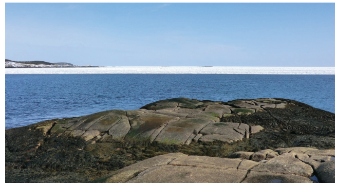
Figure 2. Whitehead just before the arrival of the drift ice. Picture taken at low tide in the afternoon of 3 April 2014 at a wave-exposed site in Whitehead, showing a full coverage of the intertidal zone by seaweed canopies and the drift ice approaching the shore. The sea surface was calm on that day.

In 2014, a large amount of floating ice fragments came out of the Gulf of St. Lawrence between late winter and early spring. In its travel south along the Atlantic coast, the ice came in contact with an approximately 92-km-long stretch of coastline in mainland Nova Scotia (Figure 1). Ice fragments varied widely in size, but together formed a relatively compact coverage of the sea surface (Figure 2–Figure 3). Such a high influx of sea ice eventually devastated rocky intertidal communities. Before the arrival of the ice in early April, intertidal habitats were abundantly covered with seaweeds and invertebrates. For example, in Whitehead (45° 12' 43.5" N, 61° 10' 25.6" W, Figure 1), high and middle intertidal elevations from wave-exposed habitats exhibited a well developed canopy of Fucus algae (Figure 4) and an abundance of mussels ( Mytilus ) and barnacles ( Semibalanus balanoides ) in understory habitats (Figure 5). At middle and low elevations from wave-exposed habitats in Tor Bay Provincial Park (45° 10' 57.6" N, 61° 21' 19.4" W, Figure 1), a dense canopy of Chondrus crispus (a red alga) dominated the landscape, while, at the lowest intertidal elevations, kelp (mostly Laminaria and Saccharina ) formed a