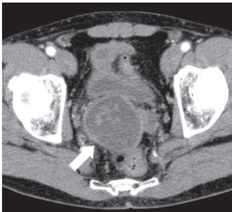
FIGURE 3: CT. Mixed mass of the right seminal vesicle (arrow).

the lesion was characterized of necrotic-haemorrhagic areas with pseudocysts. Histologic examination demonstrated a biphasic tumor: one part with ischaemic necrosis, the other without necrosis characterized by an epithelial matrix mainly cystic delimited by addensed stroma (CD34+, vimentin +, actin ML +, estrogenic and progestinic receptors +) with