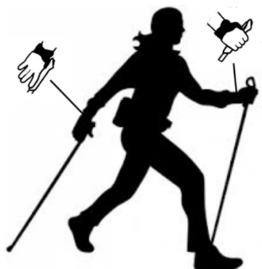
Fig. 1. Hands coordination scheme during Nordic Walking practice