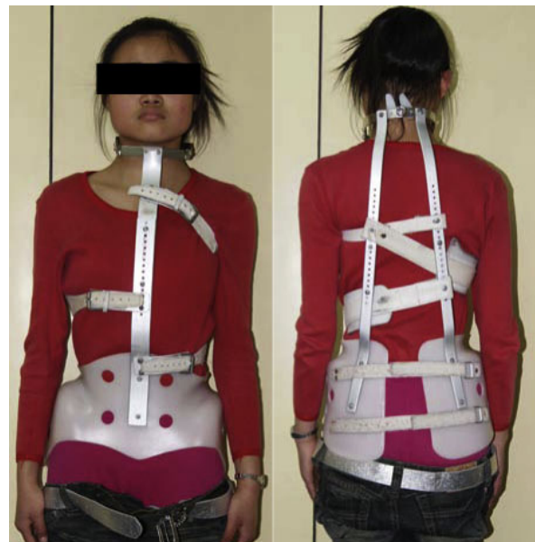
Figure 2 The same patient wearing Milwaukee brace. The neck ring cause a stimulant effect on the mandible, and two contact pads are located on the posterolateral part of the thoracic cage.

A total of 28 female thoracic AIS patients were included in this study from December, 2008 to January, 2010. All these subjects underwent careful clinical and radiologic examinations to confirm the diagnosis of AIS. They were new patients without any previous treatment and were prescribed to start standard Milwaukee brace treatments in our institution (Figure 2). All these patients had single structural thoracic curves. The average age of the patients was 14.0 years (range 12-16 years), the average Risser sign was 1.8 grades (range 0-4 grade), and the average Cobb angle was 29.6° (range 20°-44°). The apical vertebra was located in T7 in 6 patients, T8 in 11 patients and T9 in 11 patients (average 8.2). The upper end vertebra was located in T4 in 5 patients, T5 in 11 patients and T6 in 12 patients (average 5.3). The lower end vertebra was located in T10 in 4 patients, T11 in 14 patients and T12 in 10 patients (average 11.2). Two patients were before menarche. The average post-menarche age of the other 26 patients were 12.4 months (range 1~25 months). Informed consents were obtained from all the subjects and their parents. The study had been approved by the Clinical Research Ethics Committee of the hospital.