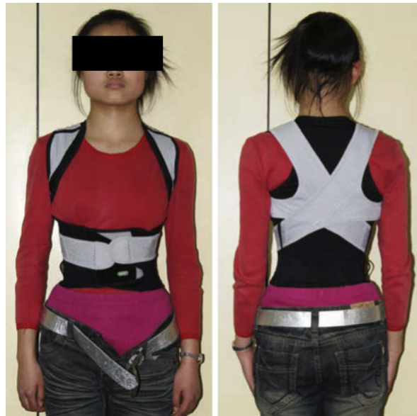
Figure 1 A 14-year-old female patient wearing elastic orthotic belt. Two straps twine around the bilateral shoulder joints to the back, then cross on the back and further extend to the front of the trunk.

such as humpback and trunk tilt. However, it was also misused by many parents who mixed the back asymmetry of AIS up with unhealthy standing and sitting postures. Some patients preferred the elastic orthotic belt even after they were prescribed to start standard brace treatment by doctors, for this new appliance is more flexible and comfortable than rigid brace, and also for the manufacturer publicly advertised its effectiveness on correcting scoliosis.