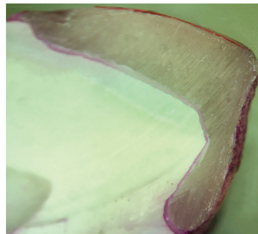
Fig. 3: Image displaying the die infiltration.

was analysed with SPSS software (IBM Corporation, Armonk, New York, USA). The Kruskal–Wallis and Mann–Whitney U-tests were conducted for the evaluation of microleakage between groups with the level of P = 0.05 significance.