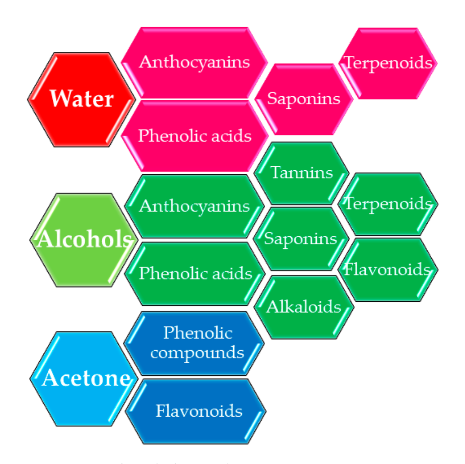
Figure 2. Commonly used solvents in the extraction process.