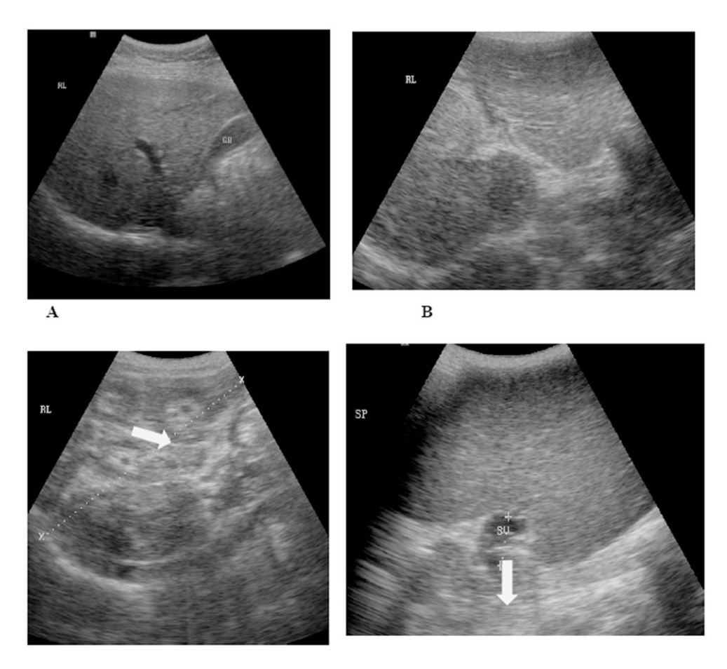
Figure 1. A, B, C, and D are representative ultrasound pictures that are seen in S. japonicum endemic areas. 1A shows a normal liver. 1B shows a liver with Grade II fibrosis (white arrow). 1C is Grade III fibrosis. The "Bull's Eye" appearance is indicated by the white arrow in this image. Image 1D shows a very large spleen with dilated splenic vein (marked by white arrow).