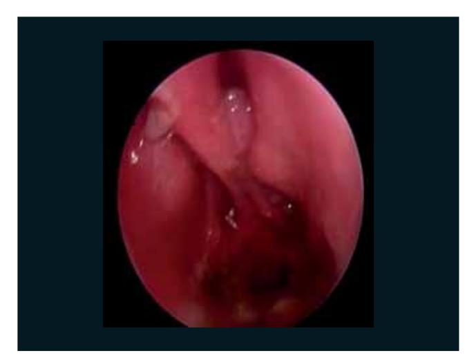
Figure 4. Nasal perforation of septo (2).