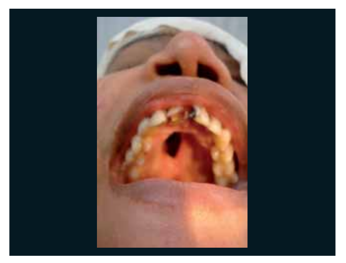
Figure 5. Hard perforation of palate.