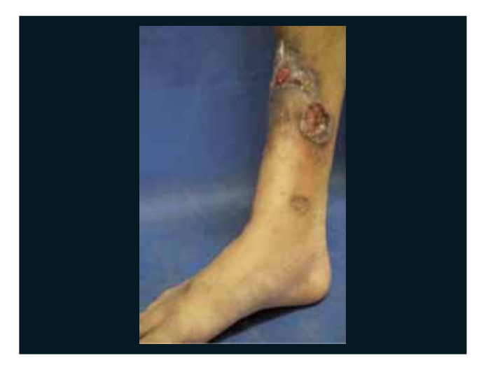
Figure 6. Ulcer of right leg.

In the laboratory examinations, did not evidence systemic illness associate. Anti-HTLV1 and 2 negatives; Ac anti DNA, anti - RNP, C3, C4, FAN, Anti-Ro, Anti-cardiolipin IgM and IgG, PCR and FR inside of the normal values; PPD: 4mm. Swab of ulcerated injury of skin became, having as resulted S. Aures. Biopsy of skin of the face, being suggestive of Pyoderma Gangrenosum and of fragment of mucous of hard palate: ulcerated chronic inflammatory process with necrosis.