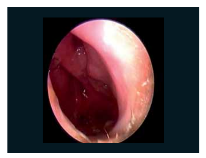
Figure 3. Nasal perforation of septo (1).