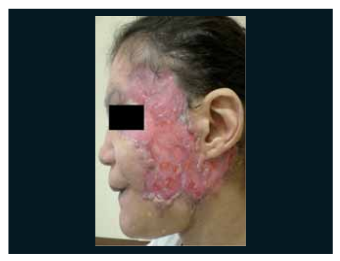
Figure 2. Face ulcer after treatment.