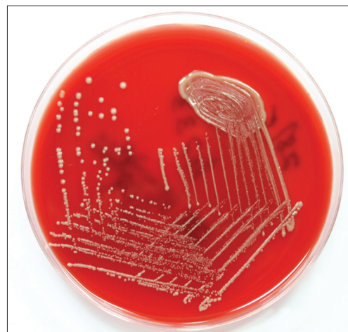
Figure 2: Cryptococcus colonies on blood agar medium