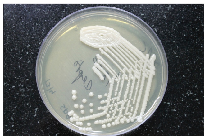
Figure 3: Cryptococcus colonies on Sabroud's dextrose agar medium