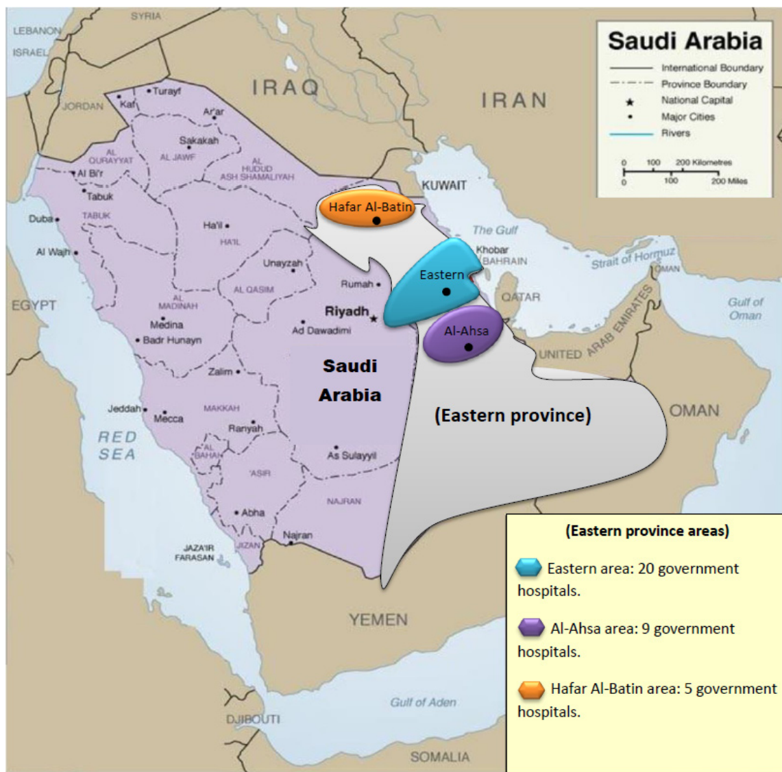
Figure 1 The main areas in the Eastern province in Saudi Arabia.

Notes: Eastern province is divided in to three main areas: 1) Eastern area (Blue area), 2) Al-Ahsa area (Purple area), 3) Hafar Al-Batin area (Orange area).