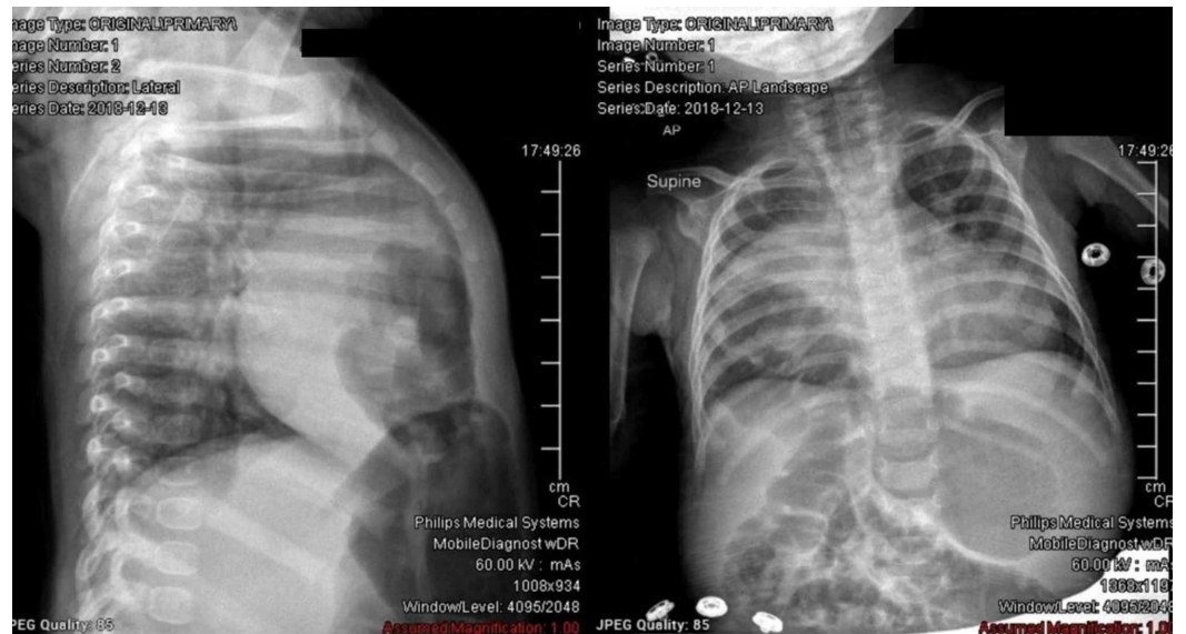
FIGURE 1: Lateral (on right) and anteriorposterior (on left) chest X-ray showing herniated colonic loops in the anterior right hemithorax consistent anterior right diaphragmatic hernia

She was then transferred to the Nemours Children's Hospital where general surgery was consulted. The patient was diagnosed with a likely Morgagni's type hernia based on her chest CT scan and her history of productive cough for five days.