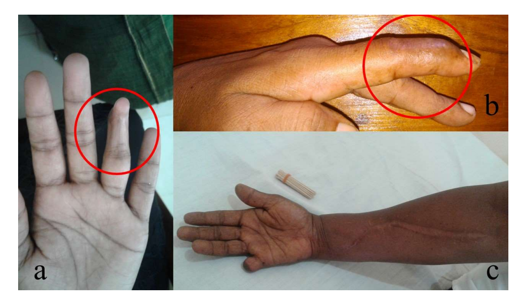
Figure 1. Various long-term local effects of the bites by Merrem's hump-nosed pit viper ( Hypnale hypnale ) in Sri Lanka: ( a ) a contracture deformity involving the distal interphalangeal joint of the ring finger in left hand (red circle); ( b ) a contracture deformity involving the distal interphalangeal joint of the index finger in left hand (red circle); and ( c ) amputation of the right little finger due to local necrosis with the fasciotomy due to compartment syndrome of the right forearm. (All photographs are published with permission of the patients).

Therefore, not only the consequences of severe local effects, but also the burden due to mild long-term local effects are important in snakebite survivors and need to be addressed (Figure 1).