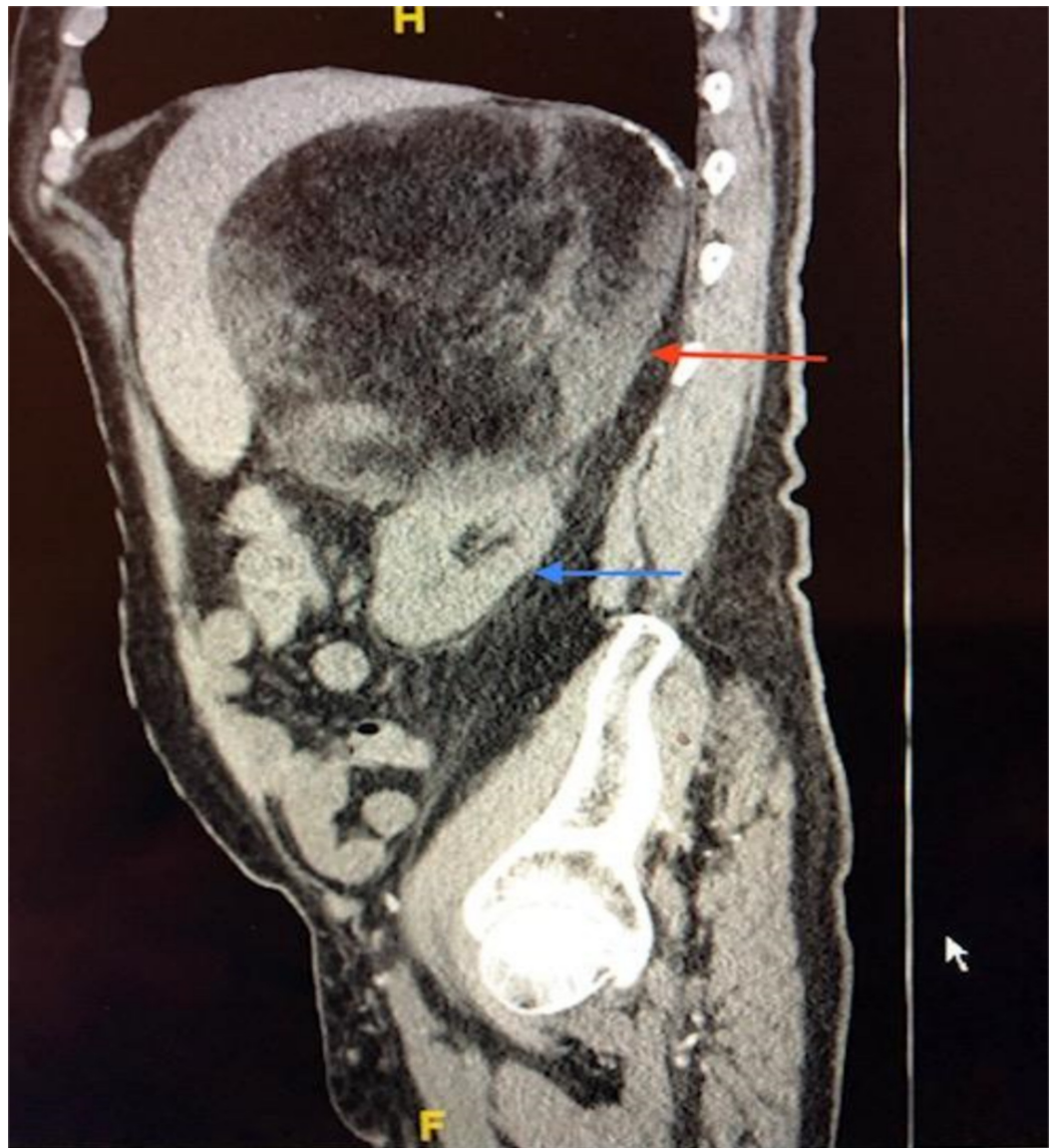
FIGURE 1: Computed tomography of the abdomen and pelvis

Adrenal mass (red arrow); Kidney (blue arrow)