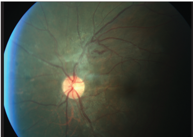
Figure 3: Posterior segment photo of the patient 2 year postoperatively