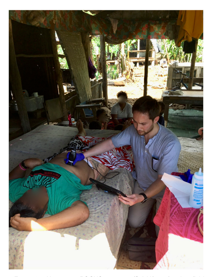
FIGURE 2. Nonexpert POCUS operator (S.A.H.) performing field examination for gallstones using the Butterfly iQ ultrasound probe. POCUS = point-of-care ultrasound.

POCUS scans performed by the two nonexpert operators, 24 (20%) were adjudicated by the expert radiologist as uninterpretable, leaving 96 interpretable scans. Scans were deemed uninterpretable primarily because of operator technique in failing to provide clear images of the gall-bladder. The most common reason cited by the radiologist was "rapid operator movement" in which the nonexpert's scan was performed at a speed too fast to provide high-quality images. The radiologist also noted that on some scans there were portions of the gallbladder where stones tend to reside (e.g., the neck of the gallbladder) that were not clearly profiled.