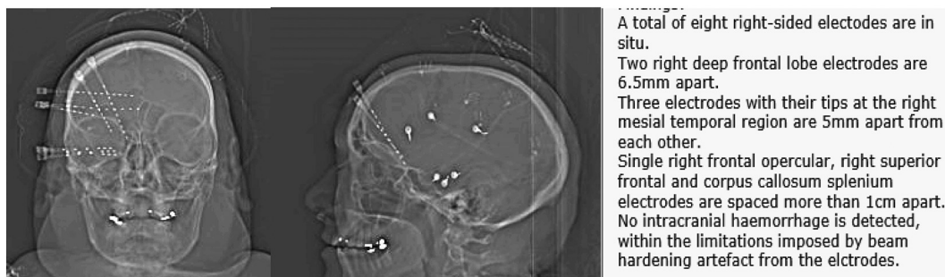
Fig. 1. Electrode placement for the intracranial study.

Six months after the surgery she taped her Acetazolamide and commenced Zonisamide 25 mg bds. She continued with pre-operative doses of Lamotrigine 350 mg bds.