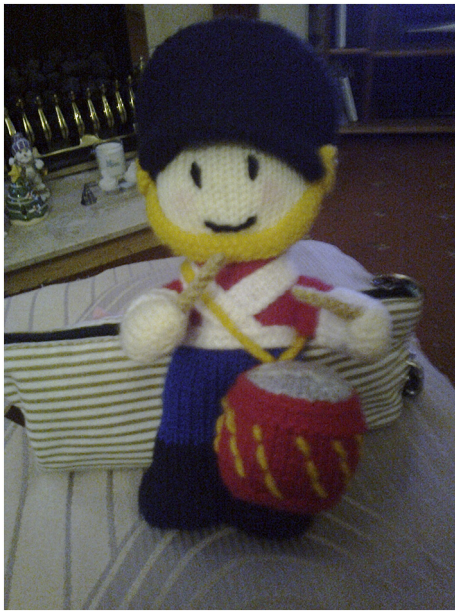
Fig. 2. Drumming Soldier: an example of one the knitted figures.

At her one-year postoperative assessments KP continued to experience seizures approximately twice a week. The postoperative declines in verbal and particularly visual memory functions which were evident at the four-month postoperative assessment remained apparent. She continued to report significant memory difficulties in everyday life. She forgets conversations and reports episodes of disorientation and difficulties navigating when she is out. She now finds it difficult to read for pleasure as she cannot commit the characters to memory. Her anxiety has reduced but she has been unable to return to work due to these difficulties.