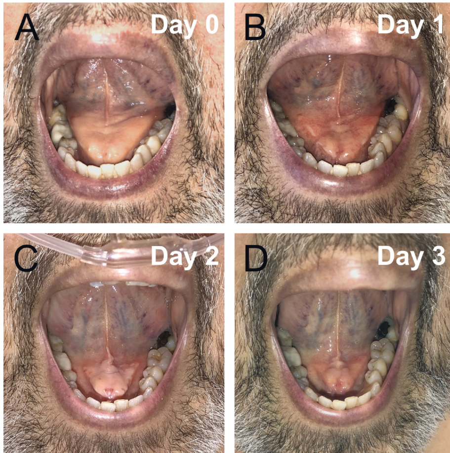
FIGURE 1: Clinical course of the patient with contrast-induced sialadenitis. (a). Day 0 (b). Day 1 (c). Day 2 (d). Day 3.

the FOM consistent with swollen sublingual glands was present without any evidence of mucopurulent drainage or fluctuance (Figure 1(a)). The rest of the physical exam was unremarkable.