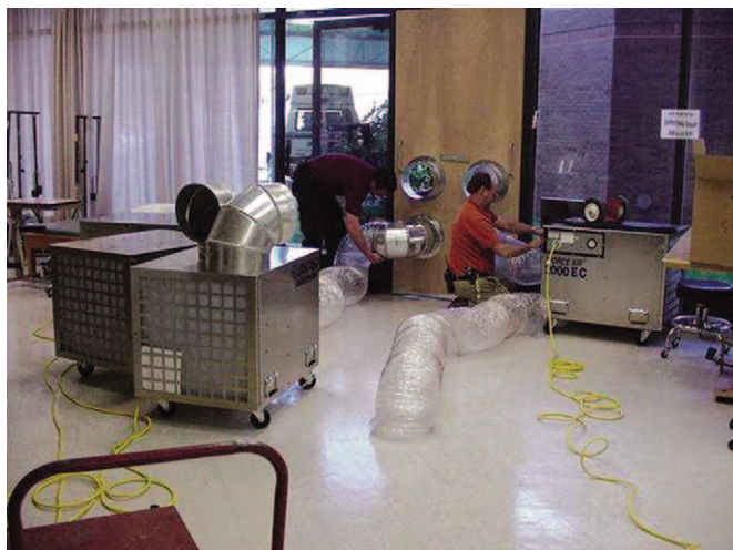
Figure 2. Photograph of HEPA filtered forced air machine installation with door insert already in place.