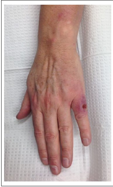
Figure 1. Overlying the patient's left fifth digit, an erythematous, ulcerated plaque is noted.