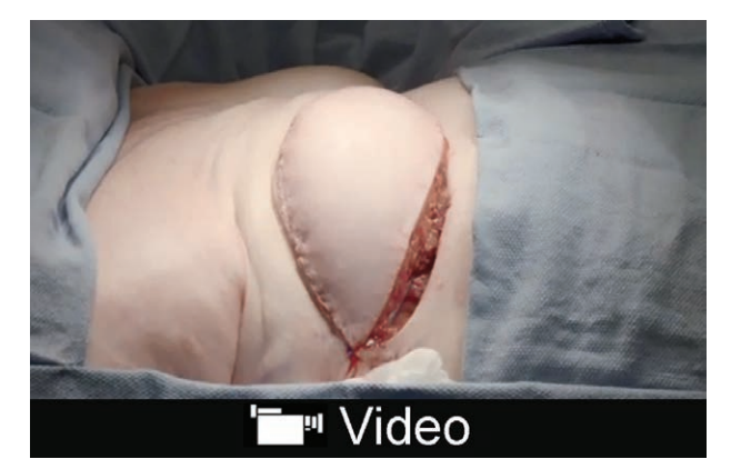
Video Graphic 1. See video, Supplemental Digital Content 1, which displays the all-in-one adjustable expander/implant technique. This video is available in the "Related Videos" section of PRSGlobalOpen. com or at http://links.lww.com/PRSGO/A631 .

The following associations were identified by logistic regression: adjuvant radiotherapy and capsular contracture (P = 0.034), tumor size and deflation (P = 0014), and smoking history and infection (P = 0.013). Of the 162 implants, 31 (19.1%) were replaced for the following reasons: extrusion (1 patient), capsular contracture (5 patients), and deflation (25 patients). Overall, 81% of breasts were successfully reconstructed using a single stage with the expander/implant approach.