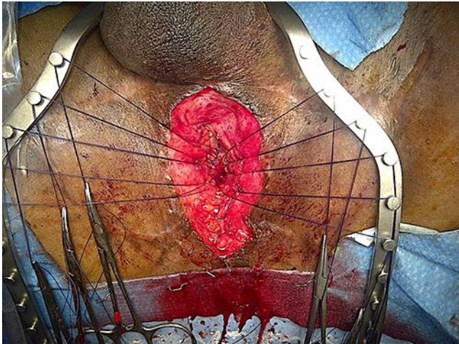
Fig. 2. The urethra has been opened and surrounding fibrotic tissue has been resected. Vicryl 4.0 sutures are placed to prepare the anastomosis for the graft.