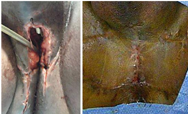
Fig. 1. Status 1 week after Blandy perineostomy, complicated by postoperative bleeding and wound dehiscence (left). Status 4 months after Blandy perineostomy and secondary wound healing. The perineal urethrostomy is completely obliterated (right).