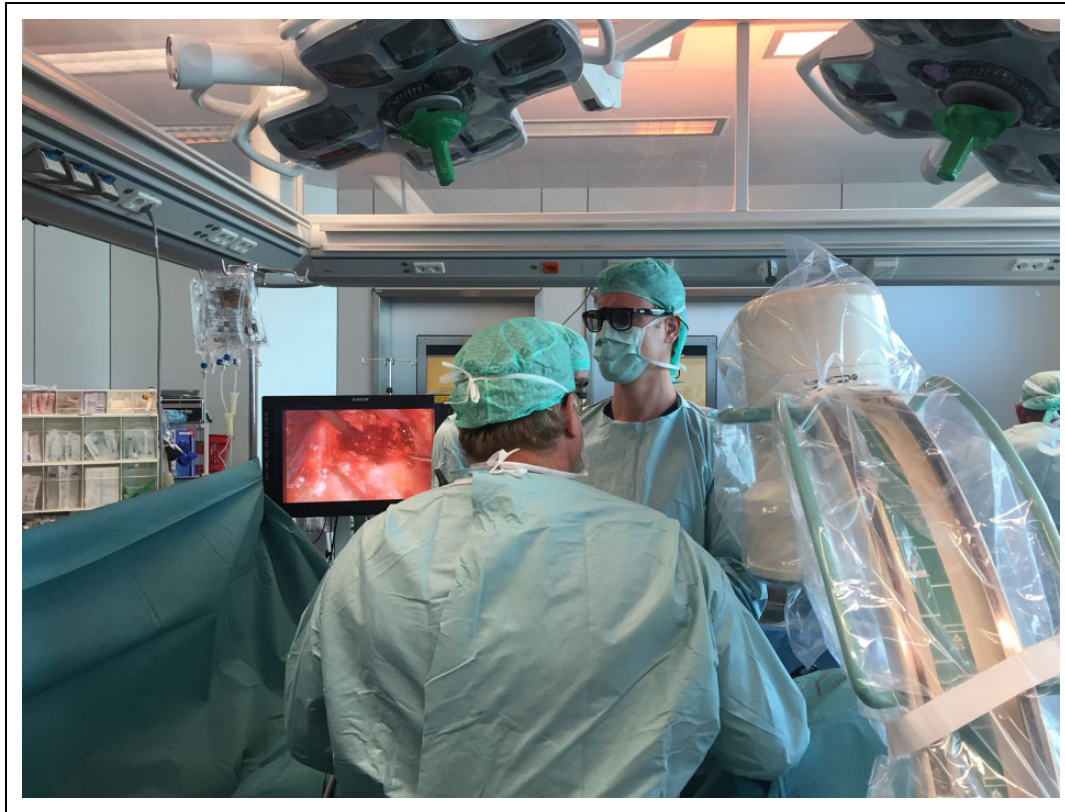
Figure 1. Per-operative setting with surgeons wearing 3D glasses.

introduction of high-definition imaging and technical improvements led to improved surgical performance in abdominal 6-9 and pulmonary surgery. The main advantage of 3D video-assisted thoracoscopy (VATS) over 2D-VATS is reported as decreased surgical time. 10-12 The use of 3D thoracoscopy for the treatment of thoracolumbar fractures or posttraumatic deformities might provide these advantages as well.