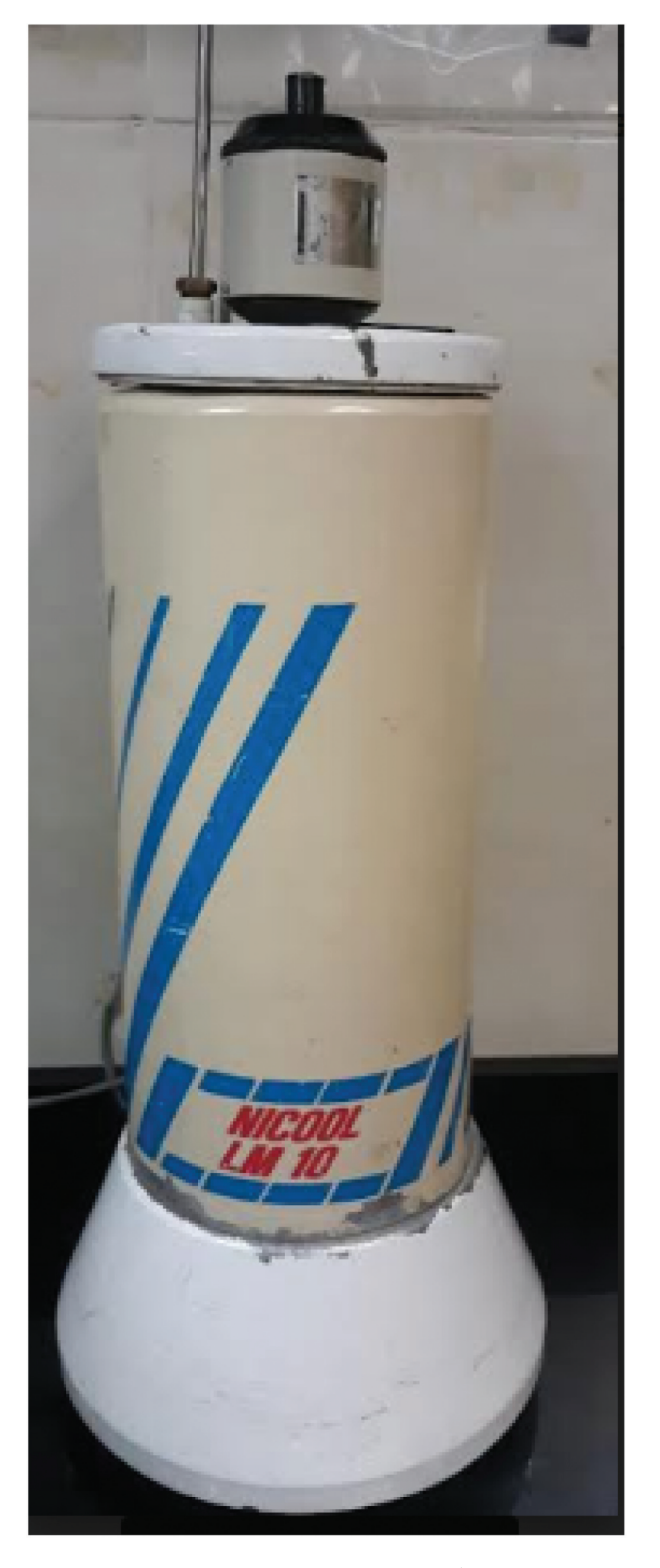
Figure 2. Nicool LM10 semi-programmable freezer.

between the laboratories in the different studies. It is obvious that there are two choices for testicular sperm preservation, freezing the sperm-containing suspensions or the testicular tissue sample, and both options are used in the selected studies. In most of the studies dealing with sperm cryopreservation, the most commonly used method was freezing in liquid nitrogen vapour for 15–30 min without the use of any device (Figure 2) that would control the freezing slope, which