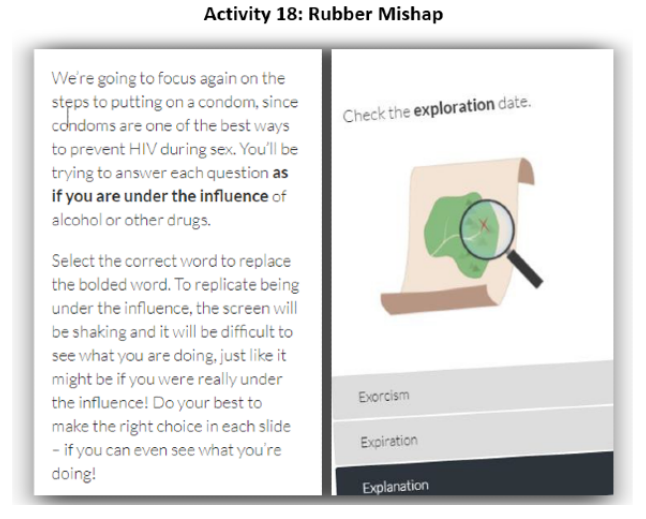
Figure 2. App activity with the screen shaking to simulate being under the influence of drugs or alcohol.

With 18 the thing started shaking so I couldn't read the thing properly. I think they should change that. If you ever have it shake, don't have it shake too much. [New York, 19 years]