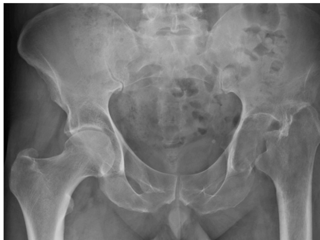
Fig. 1 – X-ray of the pelvis, with weight bearing (AP view).

He underwent X-ray examination with the pelvis bearing weight (Fig. 1), from which apparent bone necrosis of the left-side femoral head and neck was observed. A CT scan on the left hip (Fig. 2A and B) showed that complete bone reabsorption of the left-side femoral head and neck had occurred. MRI on the left hip (Fig. 3) also showed complete bone reabsorption of the proximal femur, along with the presence of a vascular "mass" in the joint space and invasion of the fossa and the upper wall of the left acetabulum and wing of the ipsilateral ilium. Bone scintigraphy was also performed and this revealed destruction of the left coxofemoral joint, with late fixation of the radiopharmaceutical.