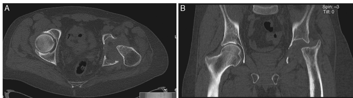
Fig. 2 – (A) CT scan of the pelvis (axial slice) and (B) CT scan of the pelvis (coronal slice).

stage of the lesion, the bone is reabsorbed and replaced by hypervascular and/or angiomatous fibrous connective tissue. Histologically, thin-walled vessels are seen to be present, and these may be capillary, sinusoidal or cavernous. At later stages, progressive bone destruction takes place, with the appearance of fibrotic tissue and massive osteolysis. 13