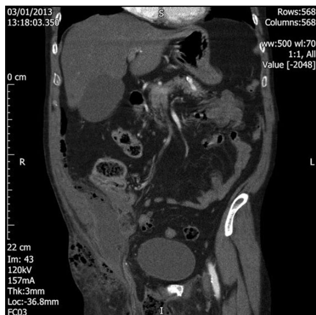
Figure 2: Coronal section CT image demonstrating extension of the loculated air superiorly into the inguinal canal and lower anterior abdominal wall and laterally into the right buttock. There is also a 10 \times 4 \times 6 cm fluid and air collection in the right pelvis.

acute appendicitis has been recognized as another cause of FG, mainly due to rupture of the viscus in the retrocaecal or retroperitoneal spaces with subsequent tracking of infection into the perineal and scrotal regions [4]. To our knowledge, this is the first reported case of FG where an inflamed appendix has been discovered to be herniating into the inguinal canal.