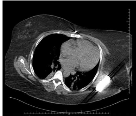
Figure 1. Computed tomography of the chest of a patient with an implanted S-ICD

Medical records of patients who had S-ICD-related interventions in Poland were retrospectively analysed. The data were collected between September 2014 and December 2015 and included: demography, past medical history, the course of S-ICD implantation or intervention, and further follow-up of the patients. Special attention was paid to the reason for S-ICD selection, the course of S-ICD implantation, and the incidence of device- or procedure-related complications. The data were obtained directly from physicians who took care of the patients. Diagnostic and therapeutic management was left to the discretion and medical routine of each department of cardiology. Because these procedures were novel in Poland, preparation to some of the S-ICD implantations was performed in contact with and under the su-