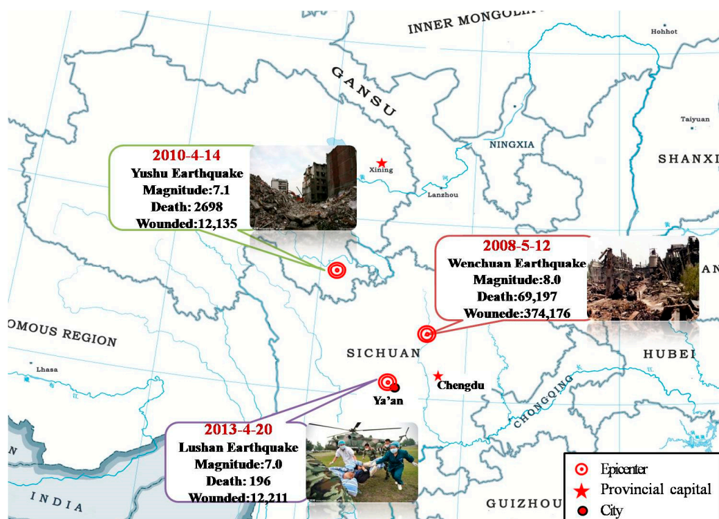
Figure 1. Overview of three catastrophic earthquakes in the past ten years in China.

Compared with other types of natural disasters, earthquakes are much more harmful and unpredictable, causing dramatic casualties and a significant loss of assets [1,2]. Western China has been identified as an earthquake-prone area, especially in the past decade, because a series of catastrophic earthquakes have occurred in succession, including the 2008 Wenchuan earthquake (magnitude (Mw): 8.0) and the 2010 Yushu earthquake (Mw: 7.1), and the 2013 Lushan earthquake (Mw: 7.0) which, combined, had a total of 72,091 reported deaths and left 398,522 injured (Figure 1) [3]. These earthquakes have brought disaster preparedness to the forefront of national policy of China. In order to allocate medical resources and implement medical relief better, it is necessary to know the characteristics of injuries sustained in earthquakes.