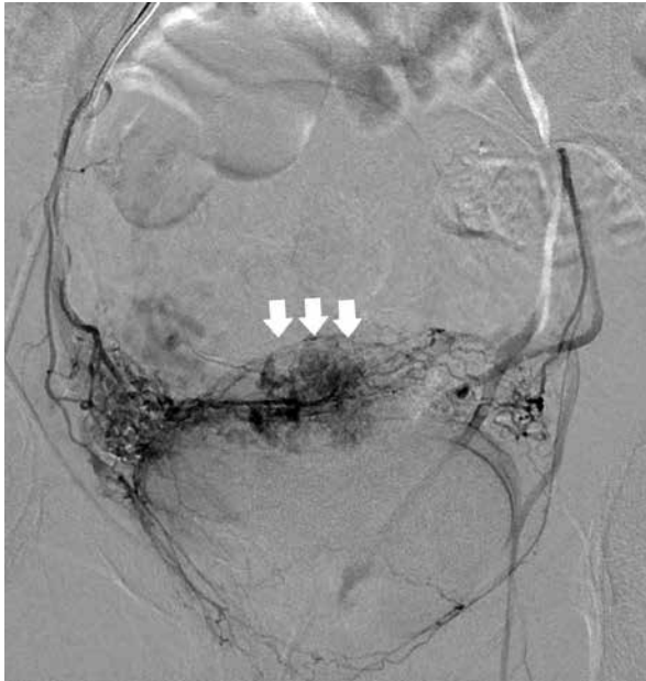
Photo 3. Additional blood supply to CSP from a superior vesical artery (arrows)

On average, the patients spent up to 6 days in hospital (range: 2–15 days), and no significant periprocedural complications were reported within that time. The long-term follow-up ranged from 7 to 79 months, with a mean follow-up time of 27 months. Thirty-six women were evaluated, and 5 were lost to follow-up (could not be contacted). During that period, no major or clinically significant complications were noted.