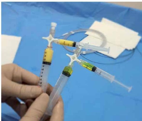
Photo 1. Materials used for embolisation – gelatine sponge (yellow) and methotrexate (green)

The aim of this study was to investigate the effectiveness and safety of UAC and to analyse failed procedures and pregnancy delivery outcomes.