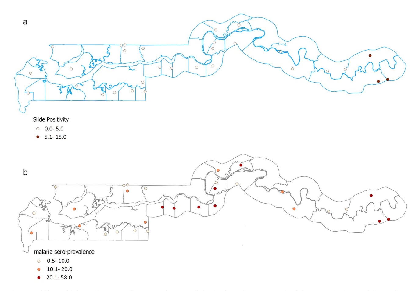
Figure 2. Slide positivity and seroprevalence rates for sampled schools. Circles represent schools location and colour graded according to the inset showing the prevalence of individuals with a positive blood slide for P. falciparum (A) and positive for antibodies to MSP1<sub>19</sub> (B). doi:10.1371/journal.pone.0110926.g002

weakly correlated with estimates by PCR although detection rates are higher in the latter compared to microscopy [14]. This is probable if the very low residual parasite densities (<300 parasites/µl) carried through the dry season is not sufficient to mount an immune response above what would be considered as