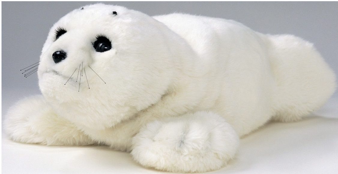
Figure 2. Paro.

in means [24]. The Paro intervention had a positive clinically meaningful influence on quality of life, emotions, pleasure and anxiety [22].