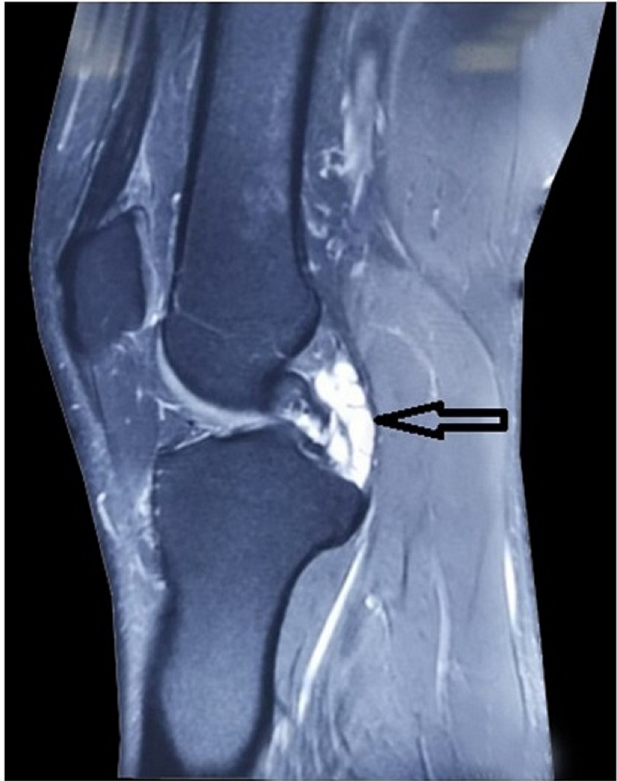
FIGURE 2: Sagittal T2-weighted MRI showing a multiloculated cystic mass on PCL (black arrow)