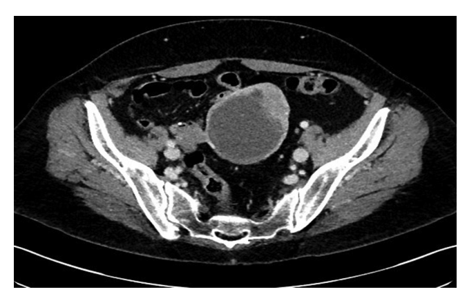
Fig. 2. An axial view of the patient's pelvis on CT scan, showing a large lesion centrally communicating with the bowel.

The patient was considered too unstable to proceed with a minimally invasive approach. She underwent an urgent laparotomy, where a large mass was discovered on the surface of the distal third of the small bowel. The tumour, adjacent ileum and its mesentery were resected and a side-to-side anastomosis hand sewn anasto-