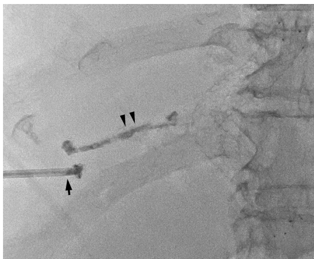
Fig. 3 – The intrahepatic sheath tract was sealed off by N-butyl cyanoacrylate (arrowheads) via the PVL sheath (black arrow), which had been pulled out of the liver.

successful reintervention 286 days after creation of a shunt for recurrent ascites. The clinical and demographic characteristics of patients are shown in Table 1. The technical and hemodynamic success rates were both 100%.