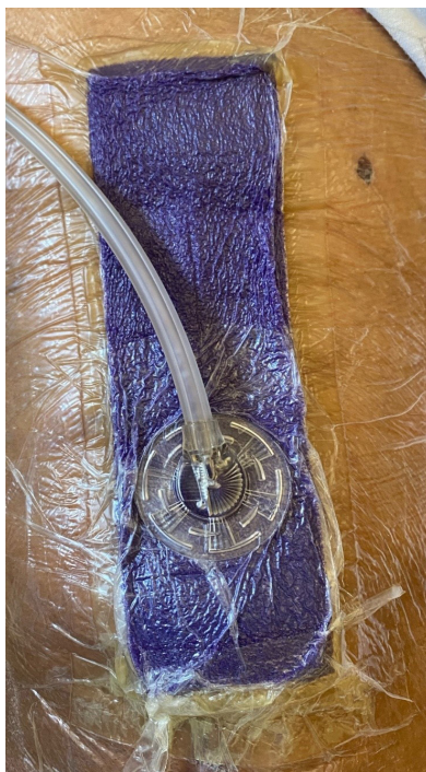
Fig. 3. Incisional negative pressure wound therapy (iNPWT) dressing. Example of iNPWT dressing utilized to create physical barrier from contamination, bring incision edges together, and remove excess fluid and infectious material.

We have found that local tissue rearrangement is sufficient to achieve definitive closure in almost all cases when primary closure is not possible. There were no patients that required free tissue transfer in this study. A history of radiation therapy to the surgical site requires wide resection of irradiated tissue and often results in a large skin and muscle defect that may not be amenable to local tissue rearrangement. Free tissue transfer may be considered; however, lack of recipient vessels and need for prone positioning of the patient limit the widespread applicability of this modality. Other options include regional myocutaneous flaps outside the zone of injury, depending on the location of the wound [25,26]. All wounds should then be managed