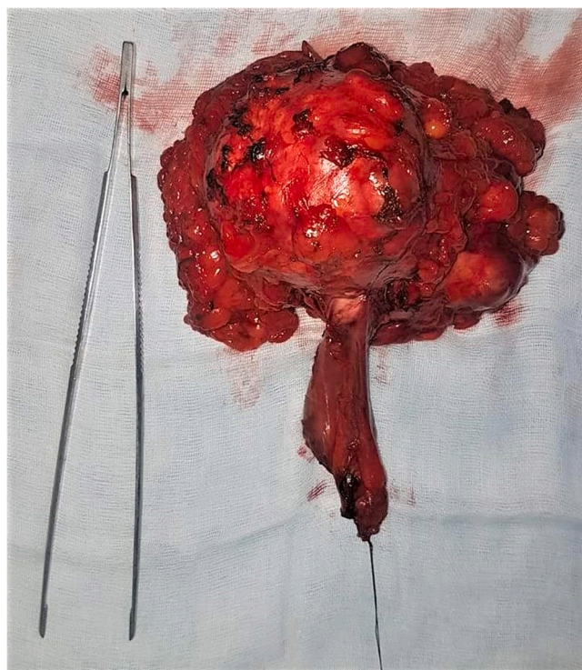
Fig. 3. Specimen of gallbladder with hydatid cyst.

Pathogenesis begins with the ingestion of Echinococcus granulosus eggs, which, in the human intestine transform into embryos, due to gastric acidity, then, penetrate actively the small bowel mucosa, enter venules and travel via portal circulation to the liver, the first biological filter [6,7]. Nevertheless, hydatid cysts can develop anywhere in the human body, tracking lymphatic system or venous cava stream [8].