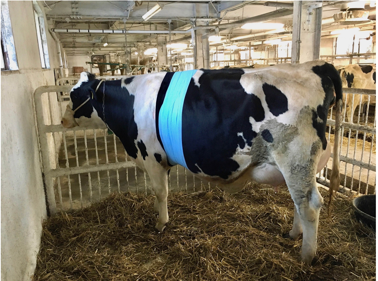
Fig 2. The electrodes, guidance cords, and a Holter-type electrocardiograph are covered with a self-adhesive elastic bandage and a felt belt to permit long-term measurement.

https://doi.org/10.1371/journal.pone.0242856.g002