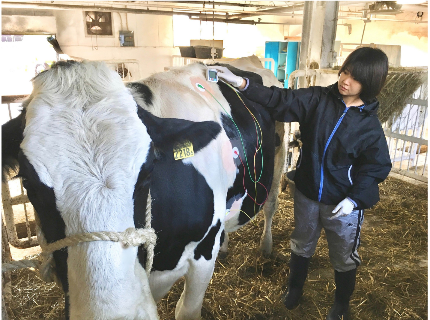
Fig 1. The electrodes are attached to the left side of the chest of the cow after hair removal. The electrocardiographic waveform can be confirmed by monitoring a Holter-type electrocardiograph.

https://doi.org/10.1371/journal.pone.0242856.g001