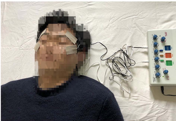
Figure 2. Patient receiving transcutaneous electrical stimulation treatment. Electrode placement was performed bilaterally. One electrode was placed over the temporal area and the second electrode was placed near the lower lid.

(46 eyes) in the SH group. The flow chart of the study is shown in Fig. 1. A total of 4 patients in the TES + SH group were withdrawn from the analysis: 2 patients (4 eyes) were lost to follow-up, 1 patient (2 eyes) underwent cataract surgery, and 1 patient (2 eyes) was withdrawn due to accidental ocular trauma. A total of 3 patients in the SH group were withdrawn from the analysis: 2 patients (4 eyes) were lost to follow-up, and 1 patient (2 eyes) discontinued treatment as she experienced no subjective improvement.