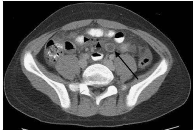
Fig. 3 A fluid-filled, round structure with mural enhancement is indicated by the arrow. Two small foci of extraluminal free air (arrowheads) are consistent with perforation