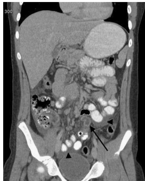
Fig. 4 Coronal imaging demonstrates a blind-ending, tubular structure (arrow) that is fluid filled and demonstrates mural enhancement. Arrowheads indicate free fluid surrounding opacified bowel loops, confirming ultrasound findings

Meckel's diverticulum (MD) occurs when the omphalomesenteric duct fails to obliterate completely during fetal life. It is the most common congenital abnormality of the gastrointestinal tract, classically thought to represent about 2% of the population. Despite the fact that this condition is relatively common, only about 4–16% of cases will lead to complications [1], which include hemorrhage, intussusception, inflammation and, occasionally, perforation, which occurred in our patient. Complications are much more common in males, and the incidence of complications