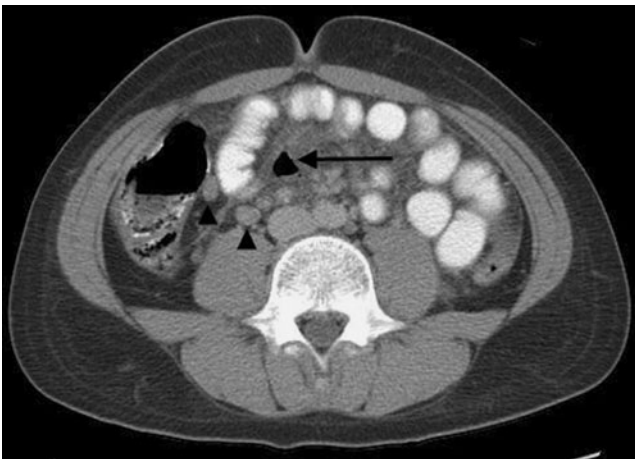
Fig. 2 Enlarged nodes (arrowheads) are seen in the right lower quadrant. A pocket of free air is in the midabdomen (arrow) with surrounding mesenteric inflammation

After his surgery, the child had a very uneventful hospital course and was ultimately transitioned from IV antibiotics and analgesics to orals and was discharged from the hospital on postoperative day 3.