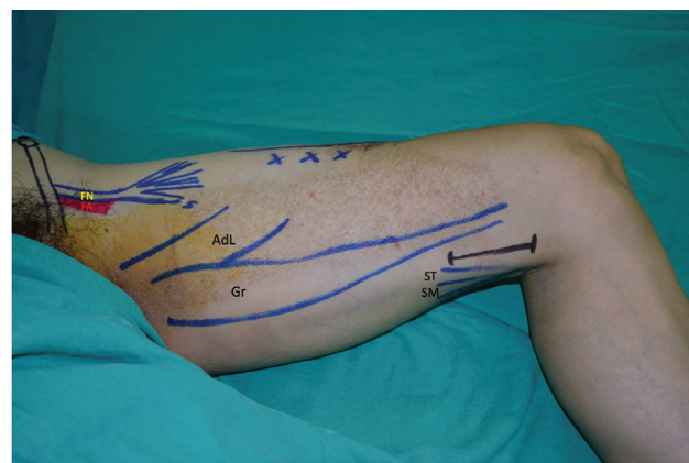
Fig. 2 Femoral nerve (FN) was identified lateral to the femoral artery (FA) in the femoral canal, beneath the inguinal ligament and with the sartorius retracted. The obturator nerve was best identified between the gracilis (Gr) and adductor longus (AdL) muscle. The incisions for the semitendinosus (ST) and semimembranosus (SM) tendons were made more distally posterior to the gracilis tendon.

made over the femoral canal from below the inguinal crease to the sartorius muscle. The sartorius was retracted laterally to expose the neurovascular bundle, where the femoral nerve lied lateral to the artery (► Fig. 2 ). The nerve trifurcated into (1) medial sensory branch, (2) motor branches into VM and