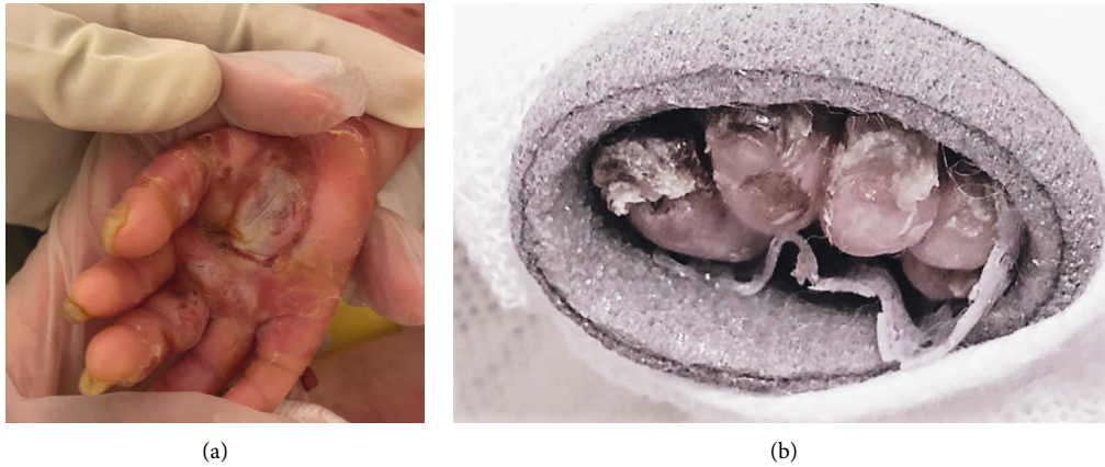
FIGURE 1: (a) Severely dystrophic fingernails of right hand and (b) toenails of the left foot wrapped in multiple layers of protective dressings.