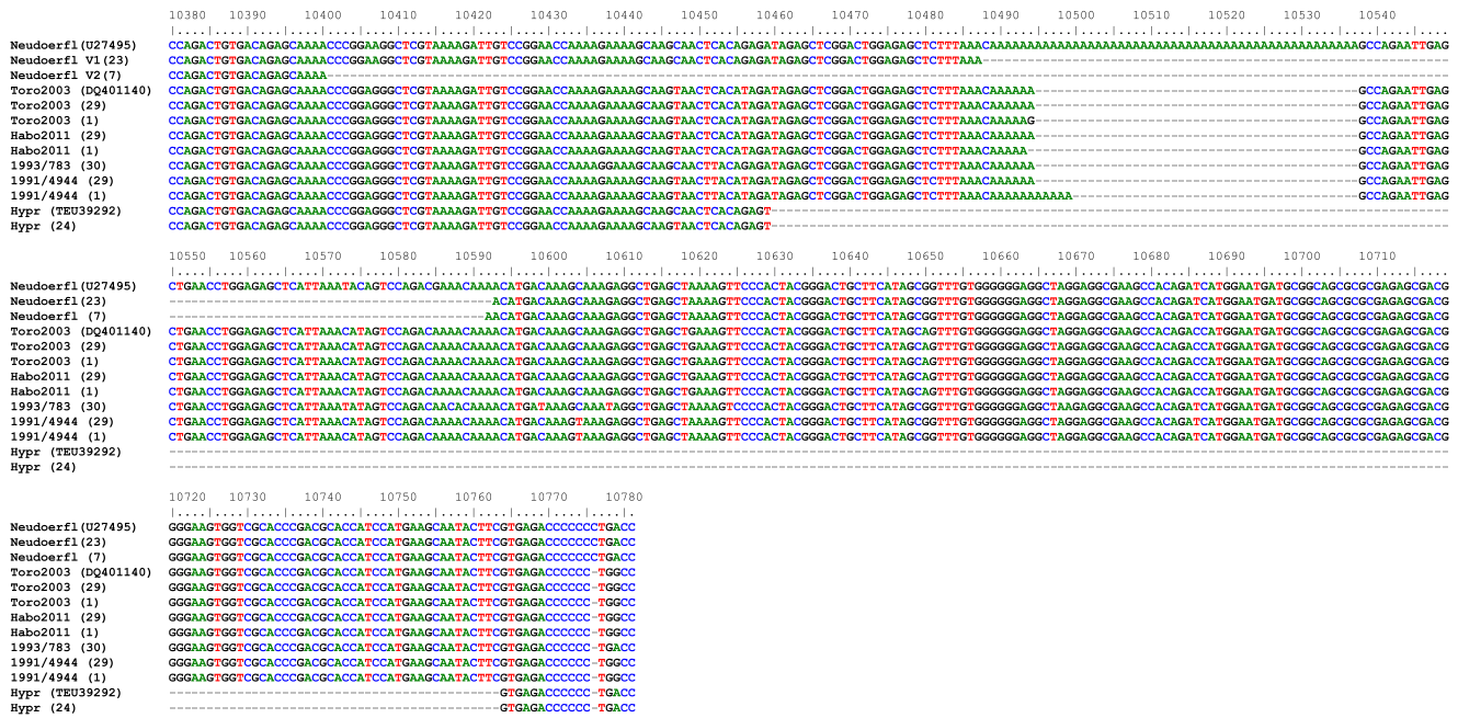
Figure 2. Genomic variations detected within the 3' NCR of W-TBEV strains. Alignment of 3' NCR partial sequences from pcDNA3.1 clones of the tick and human isolates of the TBEV to explore the existence of different variants within the individual viral pool. The two quasispecies variants of the Neudoerfl are labeled V1 and V2, respectively. Number of sequenced clones with identical sequences is mentioned within parenthesis. Nucleotide numbers correspond to the TBEV strain, Neudoerfl. doi:10.1371/journal.pone.0103264.g002

periods or that the pool of present quasispecies is different for the Habo 2011 virus. 1993/783 and 1991/4944 are two isolates from the Swedish TBEV patients [14], and all clones of 1993/783 and 29 out of 30 clones of 1991/4944 contained homogenic (A)3C(A)6 poly(A) sequences, suggesting this to be a dominant genomic structure. Interestingly, one clone of 1991/4944 contained an (A)3C(A)11 sequence, indicating that the quasispecies of TBEV with longer poly(A) tracts may also be present in the virus isolated from human patients.