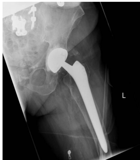
Figure 4. Axial X-ray imaging of Figure 3.