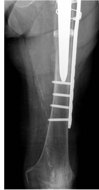
Figure 6. Postoperative X-ray image after open reduction and internal fixation using cerclage cables and plate (distal).

categorized ASA 4. One of these patients, aged 78 years, died one day postoperatively, and the other 86-year old patient deceased on the third day postoperatively.