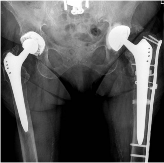
Figure 5. Postoperative X-ray image after open reduction and internal fixation using cerclage cables and plate (proximal).