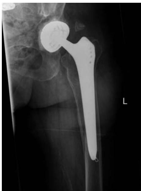
Figure 3. Preoperative X-ray image of periprosthetic femoral fracture Vancouver type B (a.p.).